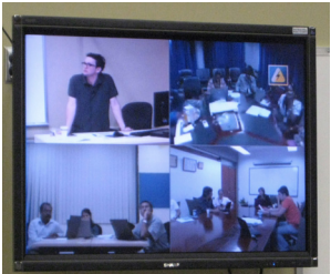
Split screen view of the Infectious Minds meeting from the four international sites: Canada, Kenya, India and Colombia

Each month a trainee-selected topic is presented by a team of trainees from different pillars and training sites. The trainees also invite a guest speaker, who is an expert in the field, to present on the topic and participate in the discussion. Below are a list of topics covered in 2012.