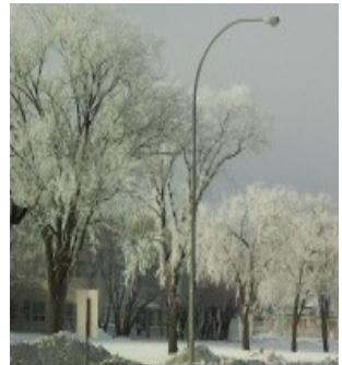
A winter day in Winnipeg, Canada