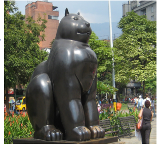
A sculpture by artist Fernando Botero in Medellin, Colombia