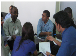
A round table discussion during the major course

lines of a clinical trial site and allow them to have the opportunity to meet those operating the trials, meet the study participants, and come to appreciate some of the challenges, opportunities and ethical issues that surround a clinical trial. The assignment challenged the trainees to understand their assigned existing trial and design a new hypothetical trial to use on site. Following the field site visits, the trainees returned to Nairobi to present their assignments in front of the class and a panel of judges, with ample time for discussion.