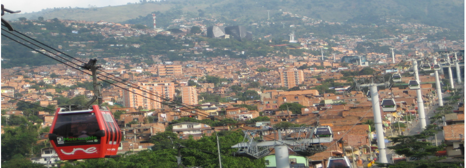
The Metrocable. A form of public transportation in Medellin, Colombia linking the city center to the undeveloped suburban areas of the city