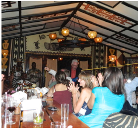
Trainees and mentors during the opening reception at the restaurant The Carnivore