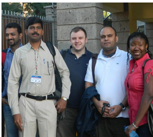
Trainees outside the residence in Nairobi, Kenya

lines of a clinical trial site and allow them to have the opportunity to meet those operating the trials, meet the study participants, and come to appreciate some of the challenges, opportunities and ethical issues that surround a clinical trial. The assignment challenged the trainees to understand their assigned existing trial and design a new hypothetical trial to use on site. Following the field site visits, the trainees returned to Nairobi to present their assignments in front of the class and a panel of judges, with ample time for discussion.