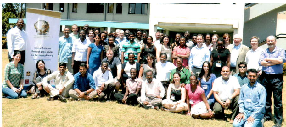
IID&GH Training Program in Nairobi, Kenya for the 2012 major course Clinical Trials and Research Ethics in a Developing Country