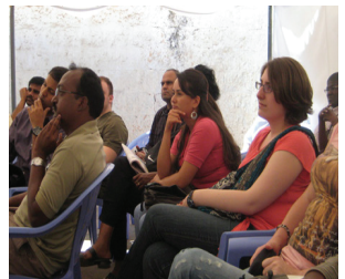
Trainees at the Majengo Sex Worker Clinic in Pumwani, Nairobi