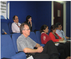
Left: Trainees and mentors taking in the Infectious Minds meeting from the Colombia site