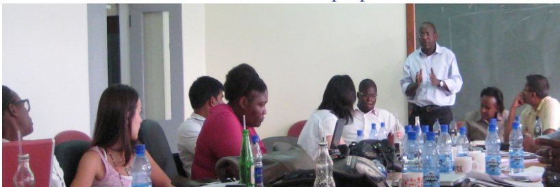
One of the lectures during the 2012 Kenya Course